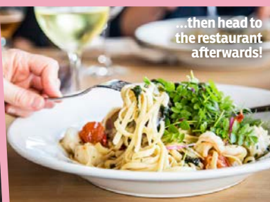
...then head to the restaurant afterwards!