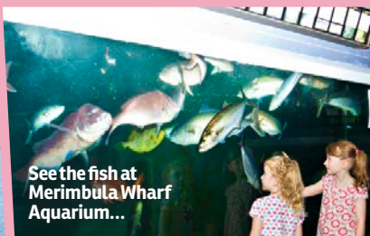
See the fish at Merimbula Wharf Aquarium...