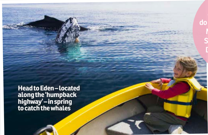
Head to Eden – located along the 'humpback highway' – in spring to catch the whales

For more amazing things to do and places to stay in Merimbula and the Sapphire Coast, visit Destination NSW at visitnsw.com