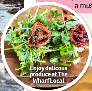
Enjoy delicious produce at The Wharf Local

Set across from the surf beach, Tathra Beach House Apartments make the perfect base to enjoy everything this bustling little town has to offer. Stop in at Tathra Hotel, which has its own in-house brewery, for delicious local produce, while The Wharf Local is a one-of-a-kind café and gallery. For great steaks and seafood, check out Fat Tony's Bar & Grill. And award-winning On the Perch Bird Park is a must for nature lovers.