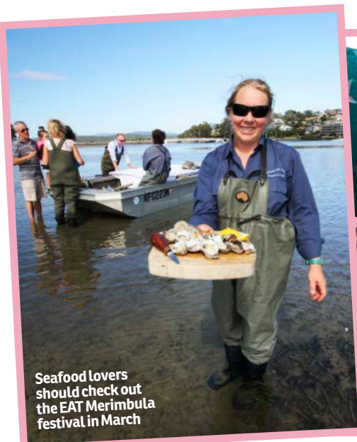
Seafood lovers should check out the EAT Merimbula festival in March